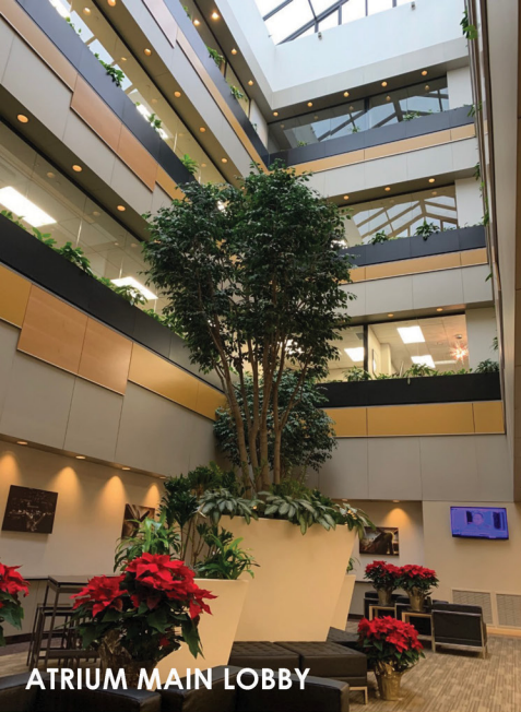
ATRIUM MAIN LOBBY