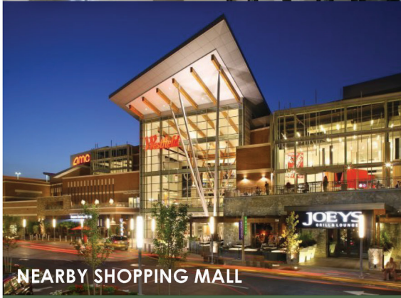
NEARBY SHOPPING MALL