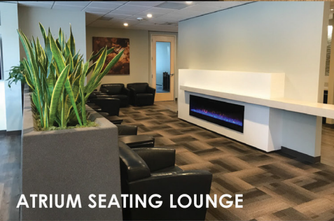
ATRIUM SEATING LOUNGE