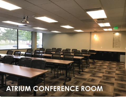
ATRIUM CONFERENCE ROOM