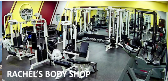
RACHEL'S BODY SHOP