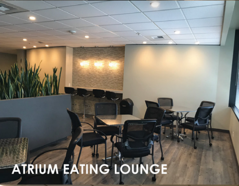
ATRIUM EATING LOUNGE