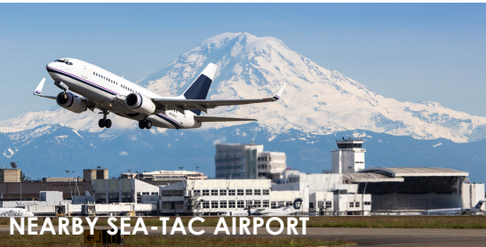
NEARBY SEA-TAC AIRPORT