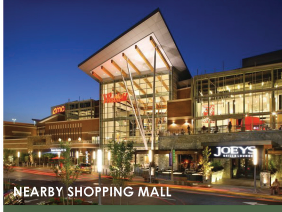
NEARBY SHOPPING MALL