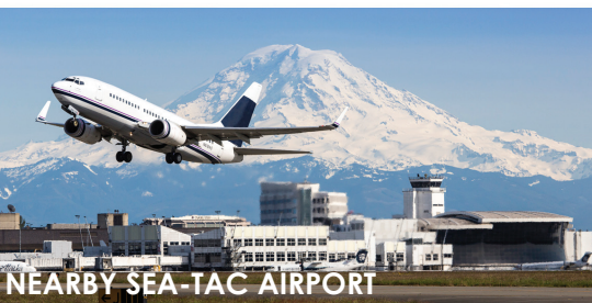
NEARBY SEA-TAC AIRPORT