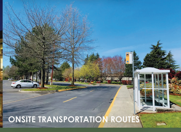
ONSITE TRANSPORTATION ROUTES