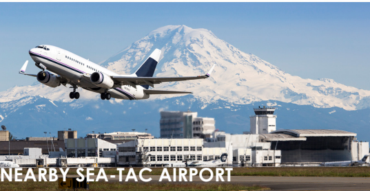
NEARBY SEA-TAC AIRPORT